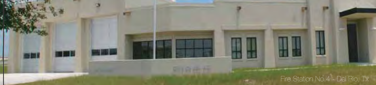
Fire Station No. 4 - Del Rio, TX